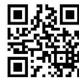
HP Public Print Locations

Scan here from your mobile device to download the app.