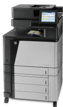
HP Color LaserJet Enterprise flow M880z Multifunction Printer

This top-of-the-line enterprise MFP helps streamline workflows and accelerate document tasks—with advanced finishing options and file sharing. Give users simple, direct access to this MFP through mobile printing and touch-to-print capabilities. 6