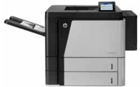
HP LaserJet Enterprise M806dn Printer

Mobile printing capability: HP ePrint, Wireless direct printing (only in M806x+ NFC/Wireless Direct), Apple AirPrint™, Mobile Apps