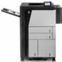
HP LaserJet Enterprise M806x+ Printer