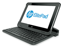
HP ElitePad Productivity Jacket