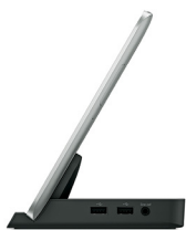
HP ElitePad Docking Station