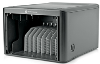
HP Multi-Tablet Charging Module