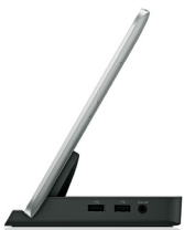
HP ElitePad Docking Station