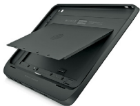
HP ElitePad Expansion Jacket with Battery