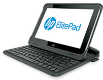
HP ElitePad Productivity Jacket