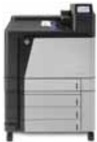
HP Color LaserJet Enterprise M855xh Printer