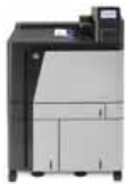
HP Color LaserJet Enterprise M855x+ NFC/Wireless Direct Printer