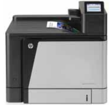
HP Color LaserJet Enterprise M855dn Printer

Mobile printing capability: 11 HP ePrint; Apple AirPrint™; Mobile Apps; HP Wireless Direct printing (standard only on M855x+ NFC/Wireless Direct)