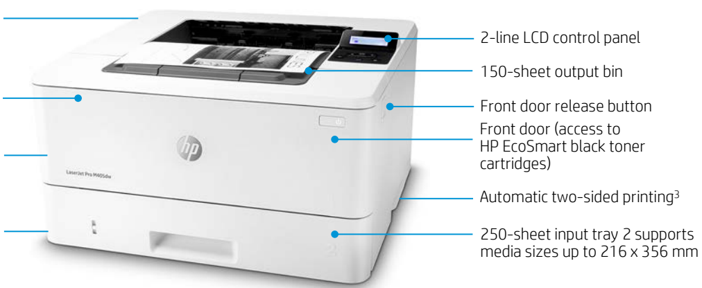
HP LaserJet Pro M405dw