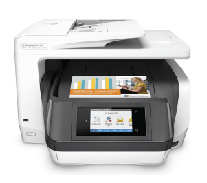
HP OfficeJet Pro 8730 All-in-one Printer