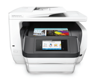
HP OfficeJet Pro 8740 All-in-one Printer