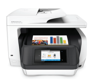
HP OfficeJet Pro 8720 All-in-one Printer