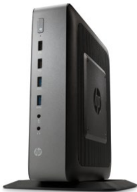
HP t620 PLUS chassis