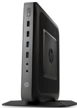
HP t620 Slim chassis

Get flexibility where you need it. Customize your thin client with everything you need and nothing you don't. Choose the configuration options and expansion capabilities that best fit your business and help ensure an ideal end user experience.