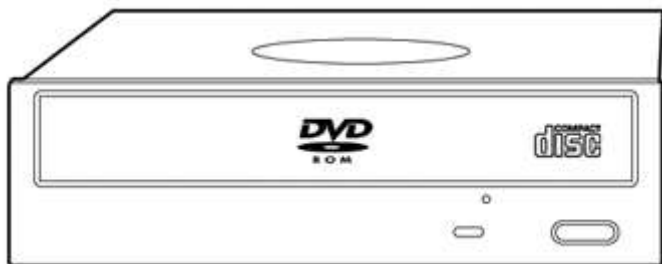
HP Half-Height SATA DVD ROM Optical Drive

The DVD ROM drive is designed to read not only CD ROM and CD R/RW discs but also DVD ROM, DVD RAM, DVD +R/RW and DVD R/RW discs.