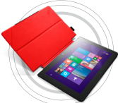
ThinkPad 10 Quickshot Cover