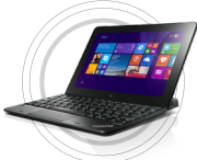
ThinkPad 10 Ultrabook Keyboard