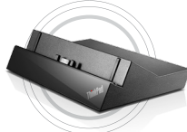
ThinkPad 10 Tablet Dock