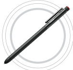
ThinkPad 10 Digitiser Pen