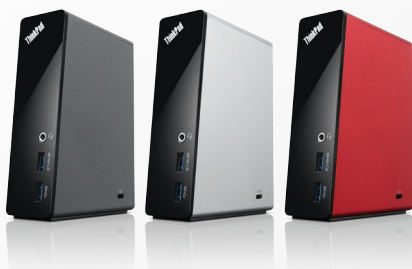
ThinkPad® OneLink Dock (4X10A060xx)