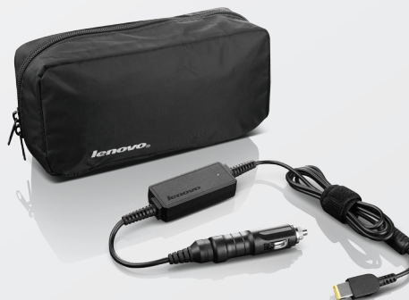
Lenovo® 65W DC Travel Adapter (0B47481)

More information on Think Accessories please visit www.lenovoquickpick.com