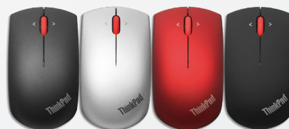
ThinkPad Precision Wireless Mouse - Midnight Black (0B47163), Heatwave Red (0B47165), Frost Silver (0B47167), Graphite Black (0B47168), Midnight Black (0B47153)