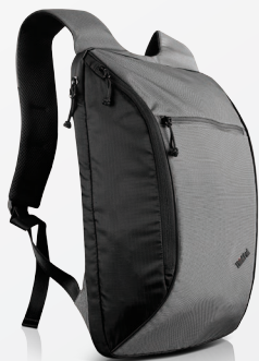
ThinkPad Ultralight Backpack (0B47306)