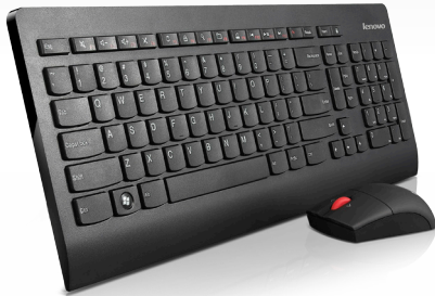
Lenovo® Ultraslim Wireless Keyboard and Mouse Combo