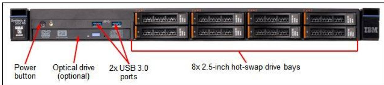
Figure 2. Front view of the IBM System x3250 M5 with eight 2.5-inch hot-swap drive bays

The following figure shows the front of the server with eight 2.5-inch hot-swap drive bays (models with 2.5-inch simple-swap or 3.5-inch simple-swap or hot-swap drive bays are also available).