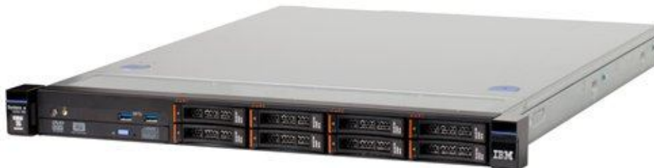
Figure 1. The IBM System x3250 M5

The following figure shows the IBM System x3250 M5.