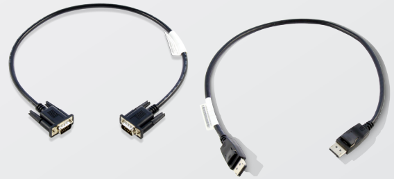
ThinkCentre® Tiny 0.5 DP and VGA Cable