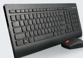
Lenovo® Ultraslim Wireless Keyboard and Mouse Combo