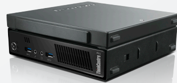
ThinkCentre® Tiny Storage Unit