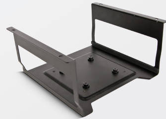
ThinkCentre® Tiny Underdesk Mount