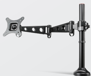
ThinkCentre® Extend Arm