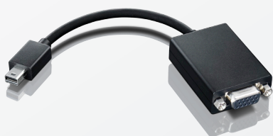
DisplayPort to Dual-DisplayPort Monitor Cable