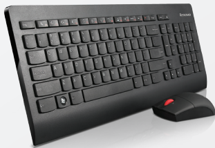
Lenovo® Ultraslim Wireless Keyboard and Mouse Combo