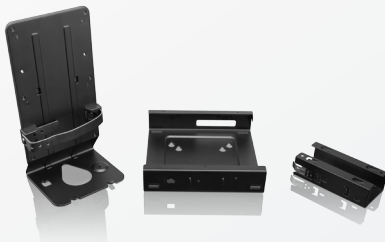
ThinkCentre® Tiny L-Bracket Mounting Kit