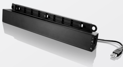
Lenovo® USB Soundbar