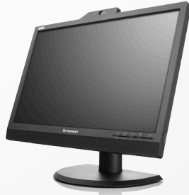
ThinkVision® LT2323z Monitor