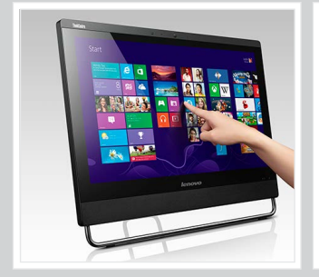
CLEAR AND VIBRANT MULTITOUCH¹ DISPLAY 10-finger touch¹ screen and full HD, anti-glare 23" LED panel