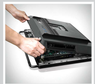
EASY SERVICEABILITY The tool-less chassis offers easy component access for quick servicing and maintenance