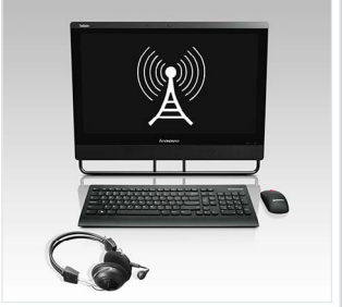
COMMUNICATION Experience excellent VoIP communication with ThinkVoIP with integrated Microsoft 1080p Lync and Skype<sup>TM</sup>, with Dolby®