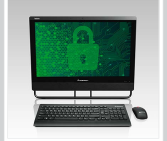
FEATURES Combination of best-in-class hardware and software features, including Computrace, self-encrypting hard drives and TPM