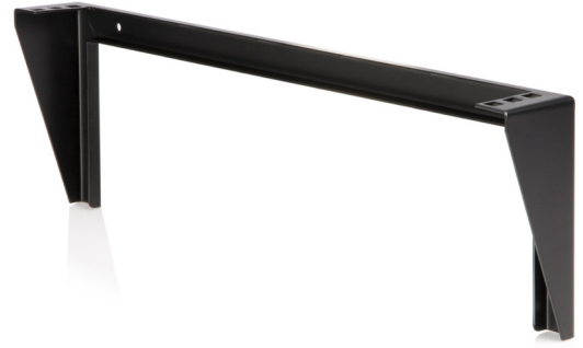
*actual product may vary from photos