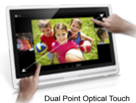
Dual Point Optical Touch