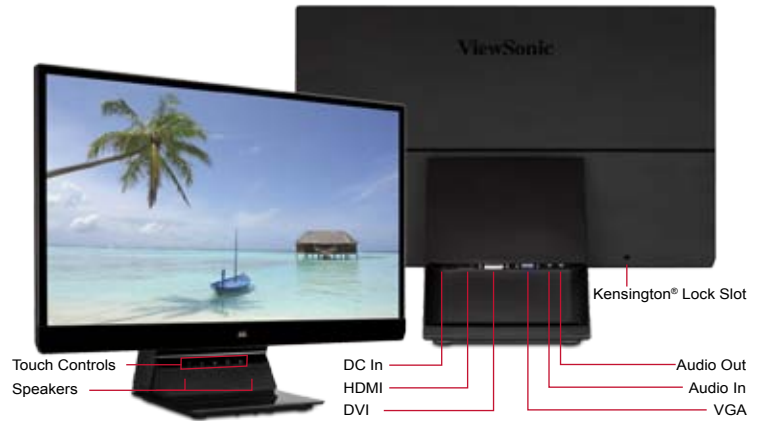
Touch Controls Speakers