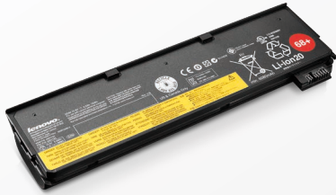
ThinkPad Battery 68+ (6 cell) (0C52862)