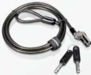
Kensington Microsaver DS Cable Lock (0B47388)