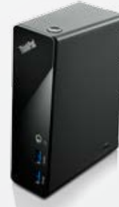
ThinkPad USB 3.0 Dock (0A33xxx)