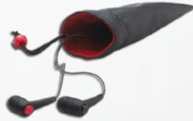
ThinkPad In-Ear Headphones with microphone (57Y4488)