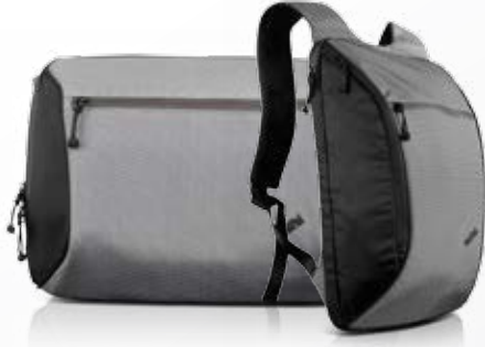
ThinkPad® Ultralight™ Backpack (0B47306) and Topload (0B47307)

Whether it is improving usability or enhancing performance, these specially designed Lenovo accessories will make your PC experience better.